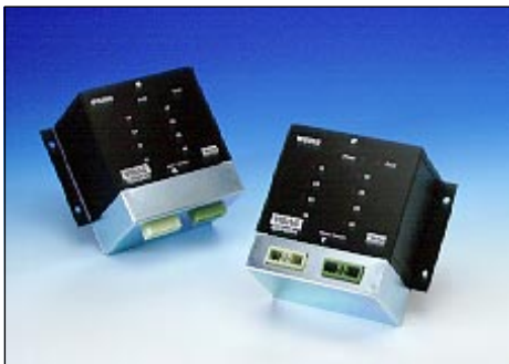
Electronic regulator units for the EHC35 system