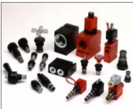
Cartridge valves with good characteristics and short response times.