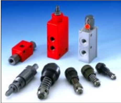
Auxiliary valves and cartridge valves with good characteristics and short response times.