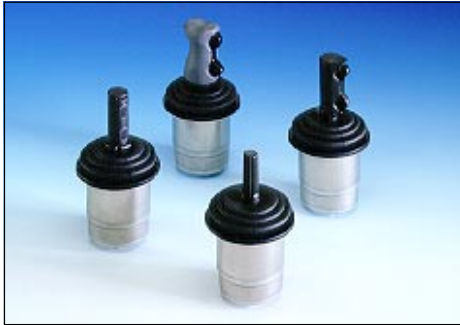
Joysticks for the EHC35 system