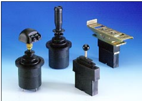
Large levers for the EHC35 system